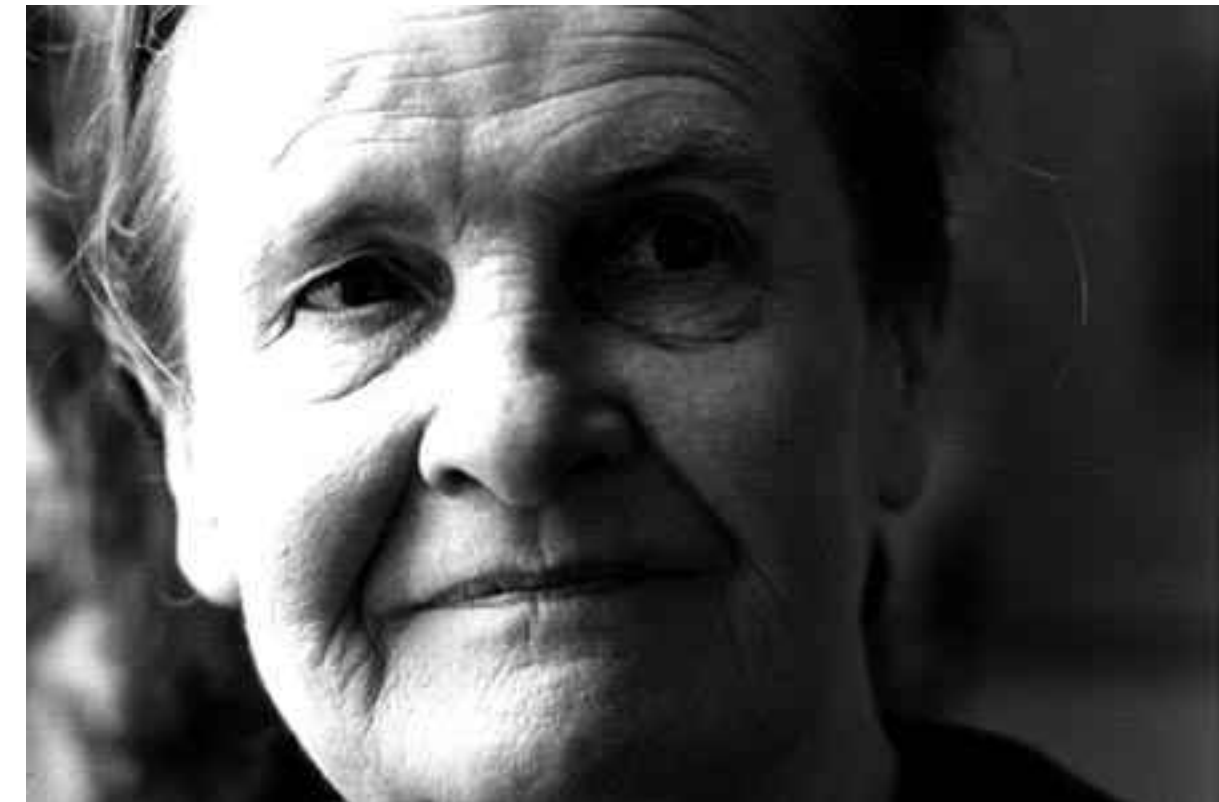
G.E.M. (Elizabeth) Anscombe (1919-2001), whose book Intention is the foundation of my project