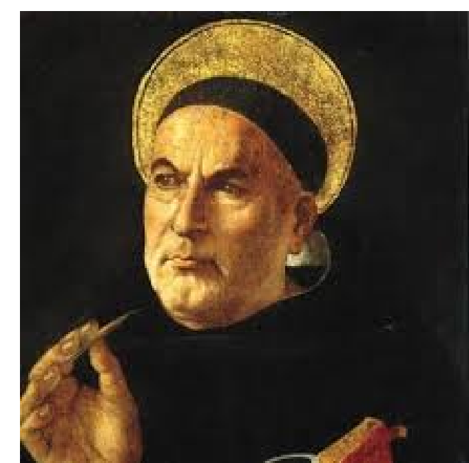
Aristotle (384 BC – 322 BC) and Thomas Aquinas (1225-1274), whose writings inspired Anscombe's position in Intention .

I develop this position in a book I am writing, in addition to several published and forthcoming papers.